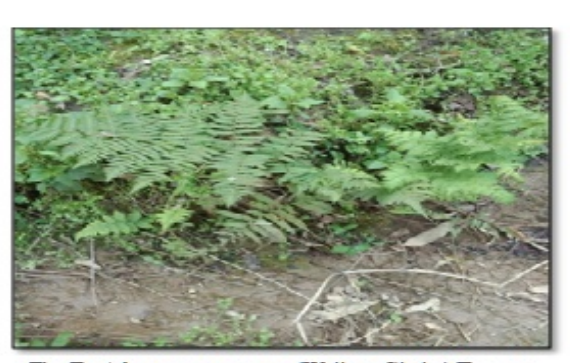
Fig. D: Athyrium attenuatum (Wall, ex Clarke) Tagawa