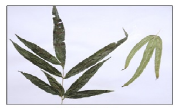
Fig. B: Pteris cretica L.