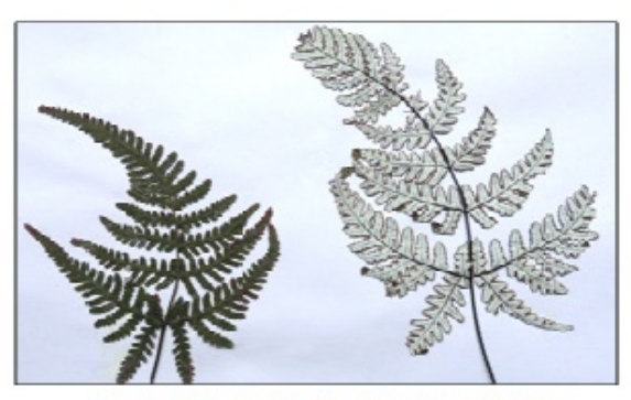
Fig. E: Cheilanthes bicolor (Roxb.) Fraser-Jenkins