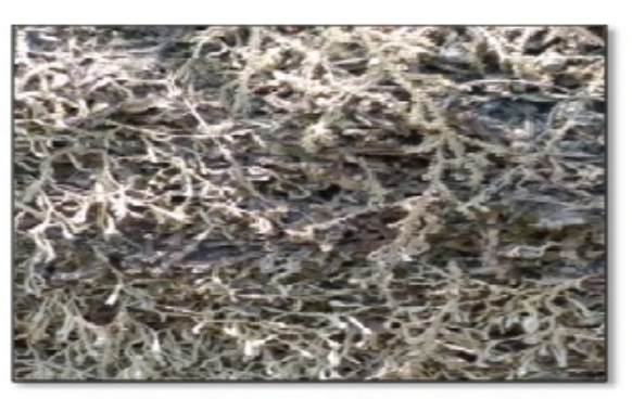
Fig. D: Selaginella chrysocaulos (Hook. & Grev.) Spring