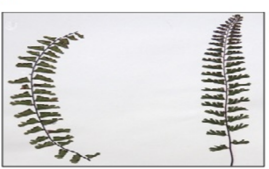
Fig. B: Adiantum incisum Forsskal