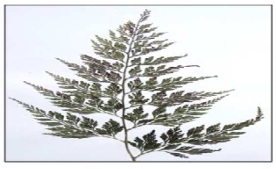
Fig. F: Onychium phonosum Ching