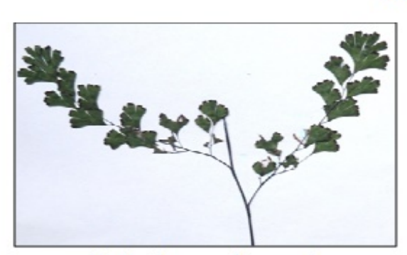
Fig. A: Adiantum capillus-veneris L.