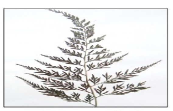
Fig. E: Onychium contiguum Wall. ex Hope