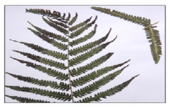
Fig. F: Thelypteris dentata (Forssk.) John

6. Onychium plumosum Ching Lingnam Sci. J. 13: 499 (1934) (PLATE I, Fig. F)