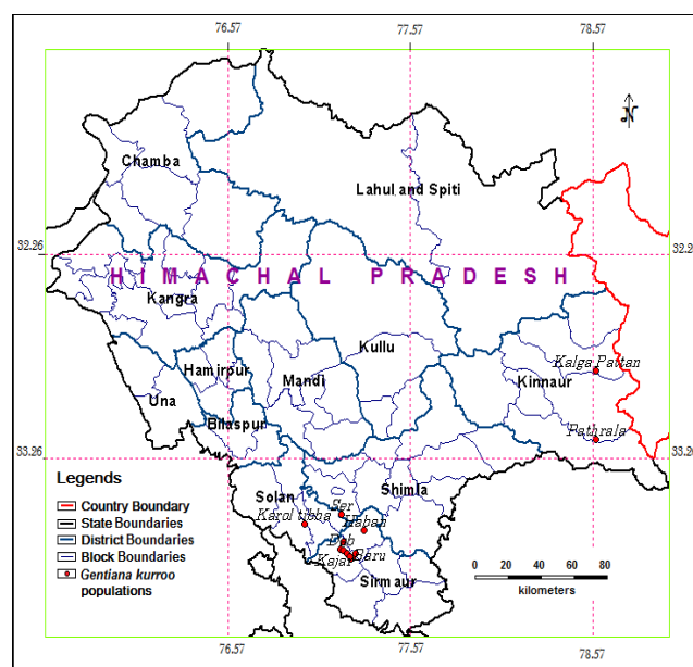
Map1: Study area and population of G. kurroo .

sampled by randomly placed quadrats. For the analysis of density Singh and Singh (1992), Dhar et al. (1997) and Samant et al. (2002) were followed. From each site samples of each species were collected and identified with the help of local and regional flora. Five soil samples, one from center and four from four corners were randomly collected from each site. Soil was cored up to 20cm depth. These samples were mixed together and a composite sample weighing 200g of the homogenized soil was collected in airtight polythene bags and brought to the laboratory for physical and chemical analysis. Moisture (%) and pH of the soil were measured. Soil was air dried and sieved with 2mm mesh and, used for analysis of total nitrogen, organic carbon and organic matter by following Allen (1974).