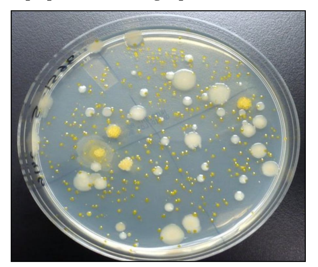
Figure 2: Isolation of estuarine bacteria from estuary mangrove water sample using 50% sea water prepared Nutrient agar plate at dilution 10<sup>-3</sup>.

CONCLUSION: Urease is an enzyme studied for a long time. Its structure, synthesis and biochemical activity are known. There are also many studies concerning urease toxic effect on human tissues. However, its role in long-lasting autoimmune diseases is still controversial. Nevertheless, the presence of molecular mimicry between bacterial ureases and human proteins has been suggested. Based on the results obtained from the standard screening, bioprocess evaluation, chemical and functional characterization and its stability criteria, this study strongly suggesting the urease isolated from estuarine bacterium. Proteus vulgaris is an ideal product for the industrial production and various applications like determining and reducing urea contaminants. Moreover, this study explored a new commercially important strain to the enzyme industries.